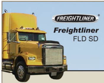
FREIGHTLINER Freightliner FLD SD